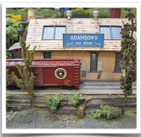
The OVAR boxcar has been spotted at Adamson's Car Shop for inspection.

HOTRAK is an HO scale modular railroad club that integrates double and single track modules into large free-form layouts. These layouts fill a large hall in Little Italy 8 times a year. We use Digital Command Control (DCC) and easy operations through a car-card/waybill system.