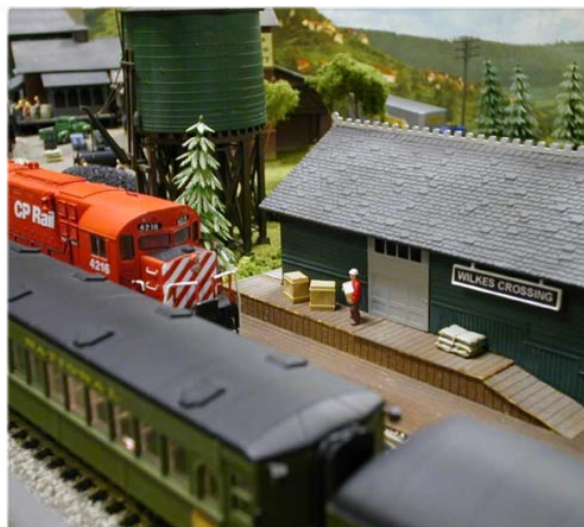
A scene from the Wilkes Crossing module

We have passenger trains based on North American and European prototypes. Our short freight trains serve local industries with a mix of freight car types while our long freight trains often serve unit or specific interests like automotive, intermodal or tank trains.